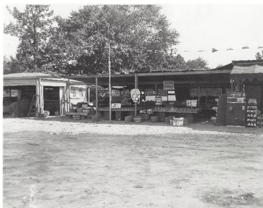
Produce Stand 26800 Harper Ave. Picture date: 1956

In a nod to St. Clair Shores' early agricultural heritage, this fruit and vegetable stand was located on Harper Avenue, north of Sunnydale.