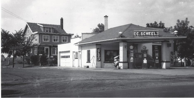
Scheel's Gas Station 33601 Jefferson Ave. Picture date: 1940s