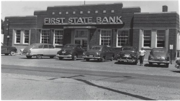
First State Bank 23400 Greater Mack Picture date: 1952

Established in 1917, the First State Bank was in this building by 1937 and remained until at least the late 1960s. The bank is now at a different location on Greater Mack Ave.