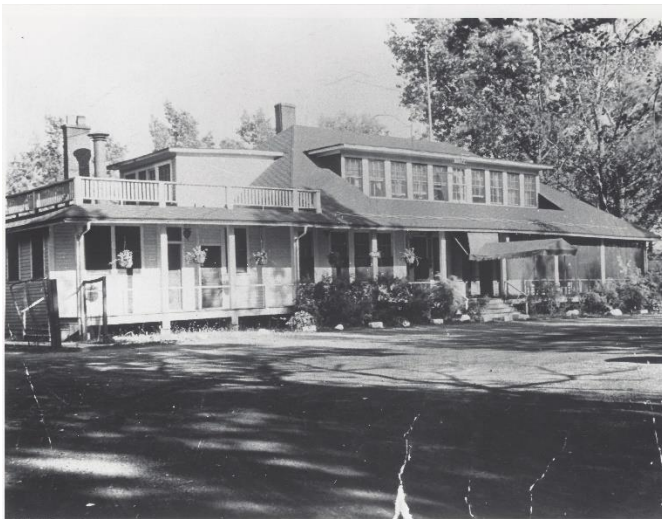
Turner Summer Home 28404 Jefferson Ave. Picture date: 1930s

Built in 1924 to serve as a German athletic club (a "Turnverein" which turned into "Turner Club"), it was also a stop on the interurban railway that ran through St. Clair Shores until the late 1920s. The building was purchased by the VFW in 1939. It was torn down in the 1950s.