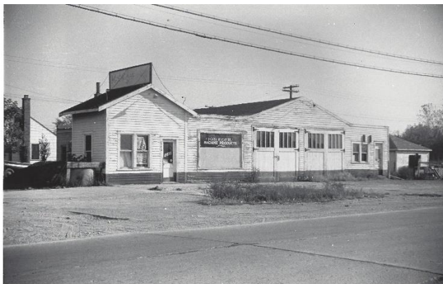
Krueger Machine Products 23418 Harper Picture date: 1940s