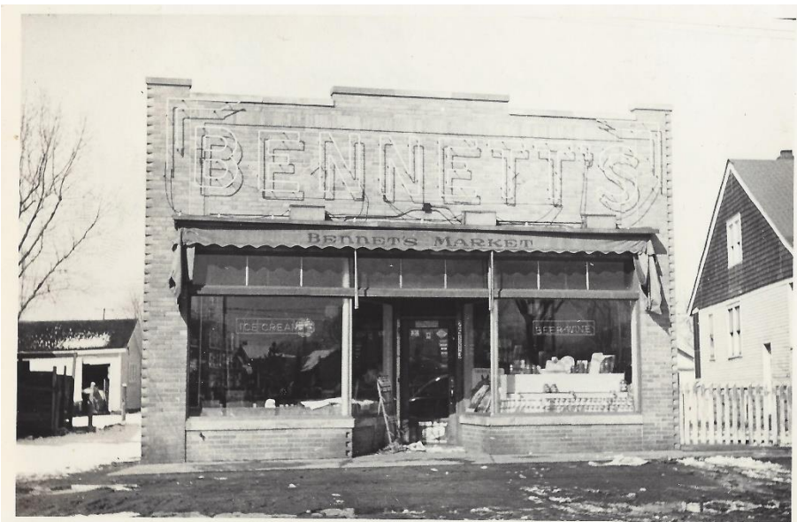
Bennett's Market 25113 Jefferson Ave. Picture date: 1940s