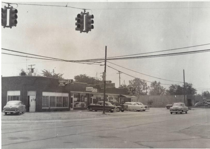
Gardella's Inn 25010 Harper Ave. Picture date: 1950s