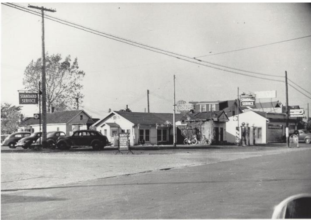
Sid's Barbeque and Sid's Roadhouse Picture date: 1940s 22385 Ten Mile Road