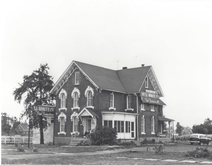
E.C. White Fine Furniture 26717 Little Mack Picture date: 1955