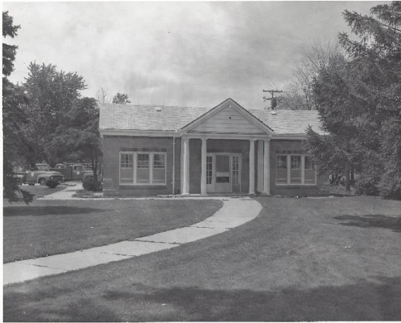
St. Clair Shores Municipal Building Picture date: unknown 27701 Jefferson Ave.

Once the site of the municipal offices (starting in 1935), the building at various times housed the room that was the public library, as well as the police and fire departments.